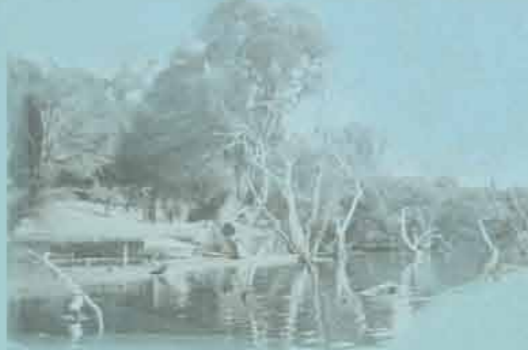
Lake Claremont, c1953