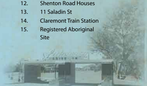
Lakeway Drive-in Site, c1957

Persons following the route suggested on this map do so at their own risk. The Town advises walkers to be sun smart and to carry a water bottle when walking the trail.