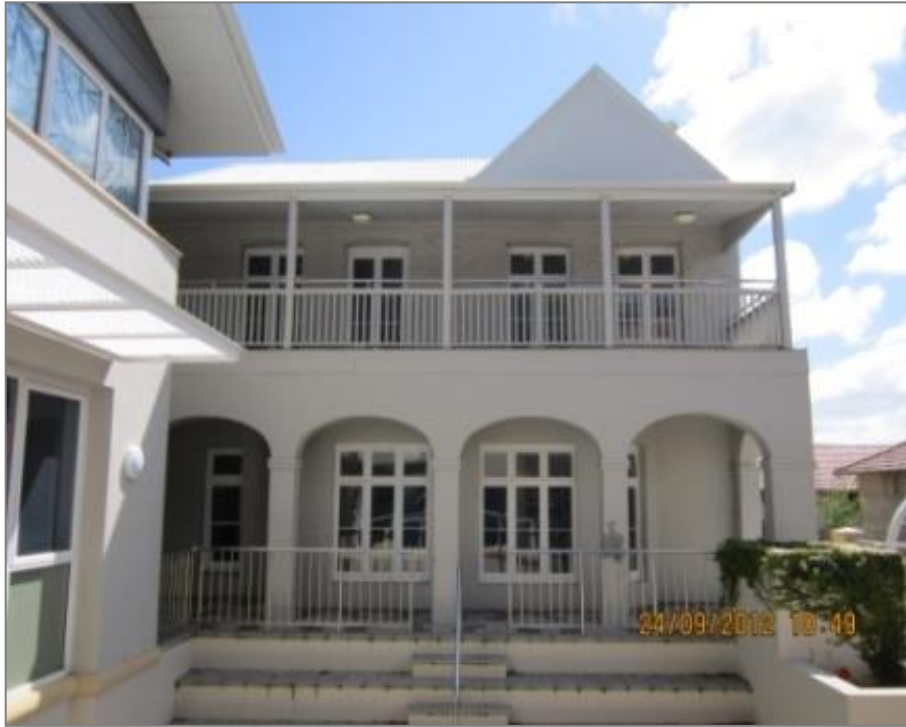
Caption Barclay House Image year Image by Copyright